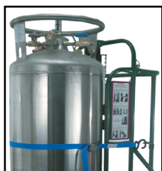
FAST ACTION SELF-SETTING "BELLY-BAND" WITH THUMB RELEASE FOR ADDED SAFETY WHEN TRANSPORTING A CYLINDER LONG DISTANCES THROUGH ROUGH OR UNEVEN SURFACES