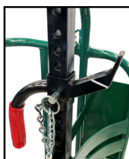
FAST ACTION ADJUSTABLE VERTICAL LIFTING HOOK

WHEEL NO: W-17FF CASTER NO: W-24R TOTAL MAX WEIGHT CAP: 1,200 lbs.