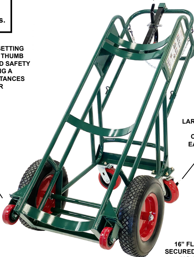
LARGE 6" HEAVY-DUTY LOCKING SWIVEL CASTERS THAT CAN EASILY BE REMOVED FOR REPAIR OR REPLACEMENT