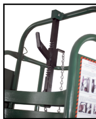
FAST ACTION ADJUSTABLE VERTICAL LIFTING HOOK