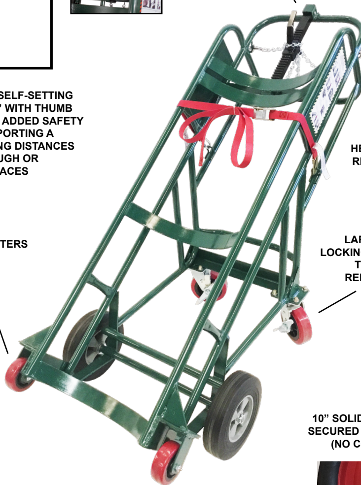
HEAVY-DUTY DOUBLE REINFORCED TUBING FRAME DESIGN