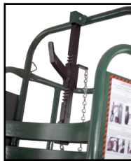
FAST ACTION ADJUSTABLE VERTICAL LIFTING HOOK